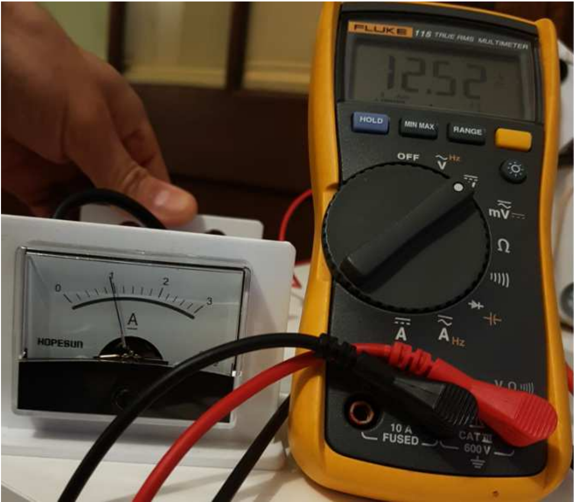
Measurement @ input after re-tuning, with battery at input (instead of a power supply)